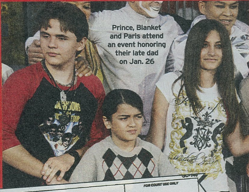
Prince, Blanket and Paris attend an event honoring their late dad on Jan. 26