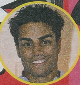
The day Katherine was allowed to return home after her kidnap drama ordeal, she lost custody of Michael's kids when a court order (left) appointed TJ Jackson (circle) as their temporary guardian

from her Calabasas, Calif., home, even though she'd suffered a mini-stroke just days before, says the insider. They apparently told Katherine they were taking her to a concert in Albuquerque, N.M., the insider says. Instead, she was whisked away to an Arizona spa where "they wouldn't allow her to contact anyone - not her grandchildren, husband Joseph, lawyer - no one!" says the insider. "The only reason she didn't call anyone was because she wasn't allowed to! She loves Michael's kids more than anything else in the world and the only reason she didn't contact them was she was blocked from making calls!" For days, the scheming siblings tried yet again to get their mom to make Rebbie guardian of Michael's kids, claims the source. Randy was the mastermind behind the plot, charges the insider. He pressured Janet, Rebbie, Jermaine and Tito into going along