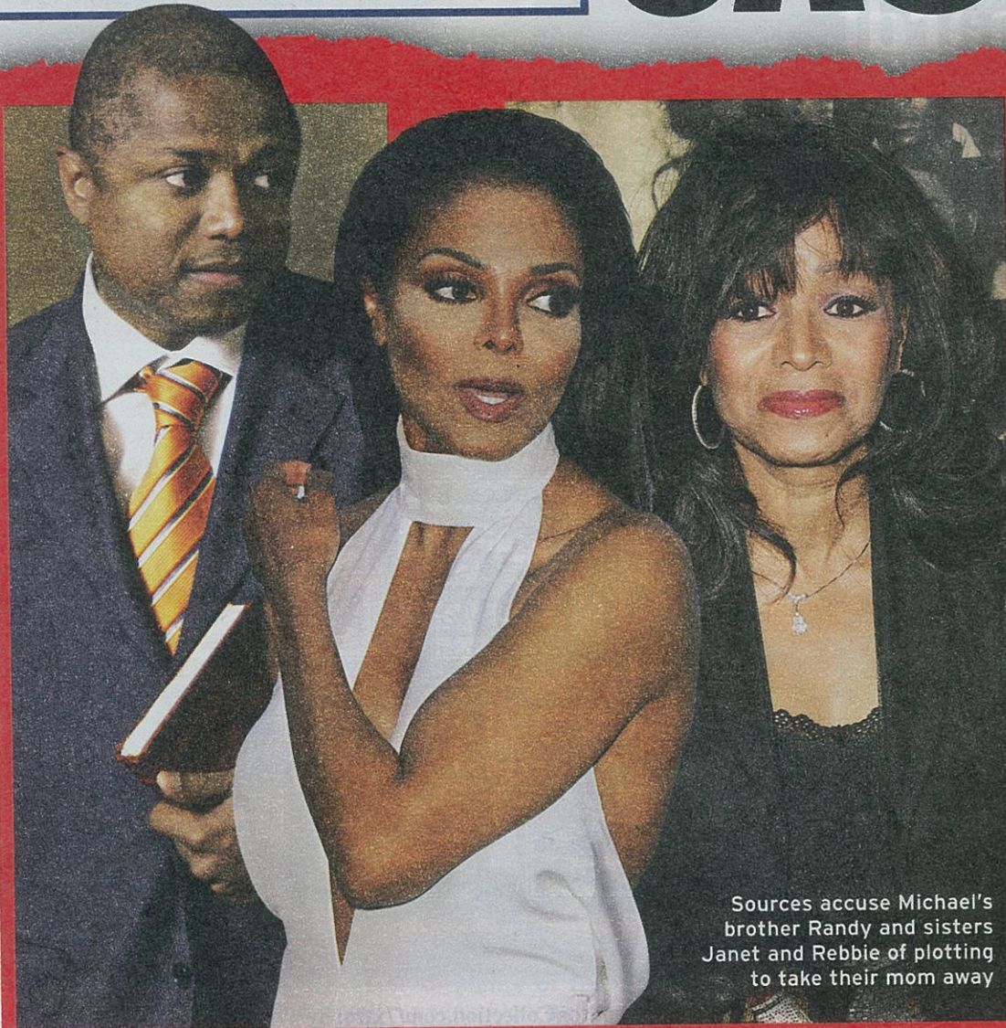
Sources accuse Michael's brother Randy and sisters Janet and Rebbie of plotting to take their mom away