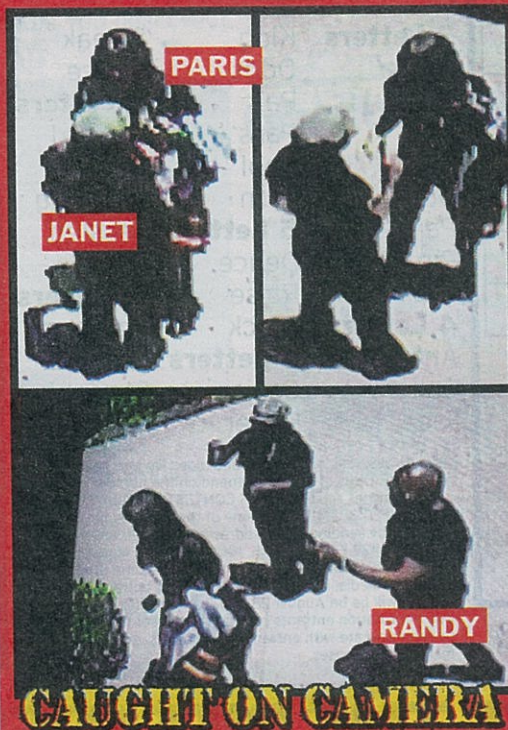
CAUGHT ON CAMERA A video captures Janet Jackson confronting her niece Paris before the showdown was broken up at the family's Calabasas, Calif., compound on July 23